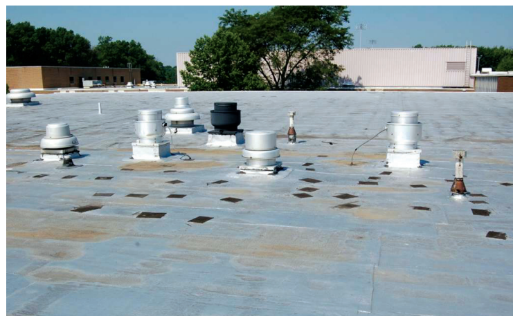
Portion of OFHS Roof BEFORE Phase 1 Repairs

This zero additional taxes bond issue is about ensuring that Olmsted Falls City Schools has the funds to pay for upgrades to mechanical systems and school renovations so that money will not have to be diverted from the classroom teaching and instructional budget. Should you have any questions please feel free to contact my office at 440-427-6040.