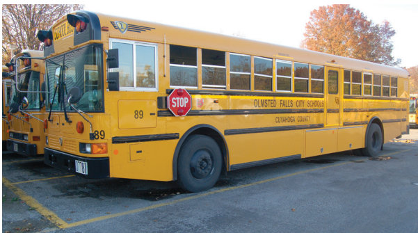
During last school year, Olmsted Falls School District's fleet of buses traveled a total of 319,992.3 miles.

Planning ahead for transportation services is another critical summer task. This year Permanent Improvement funds were used to purchase an additional school bus for our fleet, allowing us to retire one of our older buses. The district will take delivery of a Blue Bird All American this December thanks to the dedicated Permanent Improvement funds which can only be used for projects and purchases with a useful life of five years or more. P.I. funds cannot be used to pay for salaries or benefits. Olmsted Falls Schools meticulously maintains our bus fleet in top condition, allowing us to get on average more than 20 years out of each bus purchased.