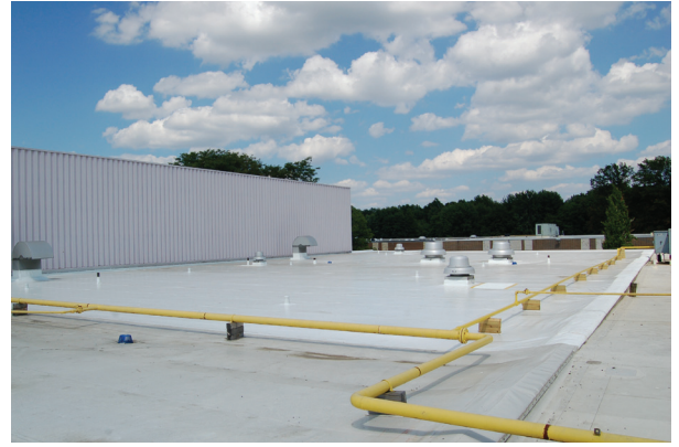
Portion of latest roof replacement completed at OFHS this summer.

The summer months are busy ones throughout Olmsted Falls School District. Each year, the empty buildings and quiet grounds provide the perfect opportunity to tackle larger maintenance projects that help keep our facilities in good repair. This summer, a number of facilities projects were underway including an additional phase of roof replacement at Olmsted Falls High School. Over the course of the last four summers, Permanent Improvement (P.I.) funds have paid for the replacement of the vast majority of the high school roof. The roof replacement occurred in phases with this summer's replacement of the western portions of the building being the fourth phase towards the project's completion.