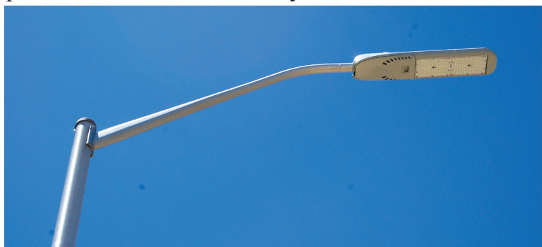
Upgrades to exterior lighting enhanced both efficiency and security.