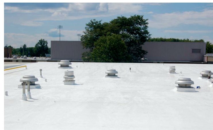
Portion of OFHS Roof AFTER Phase 1 Repairs